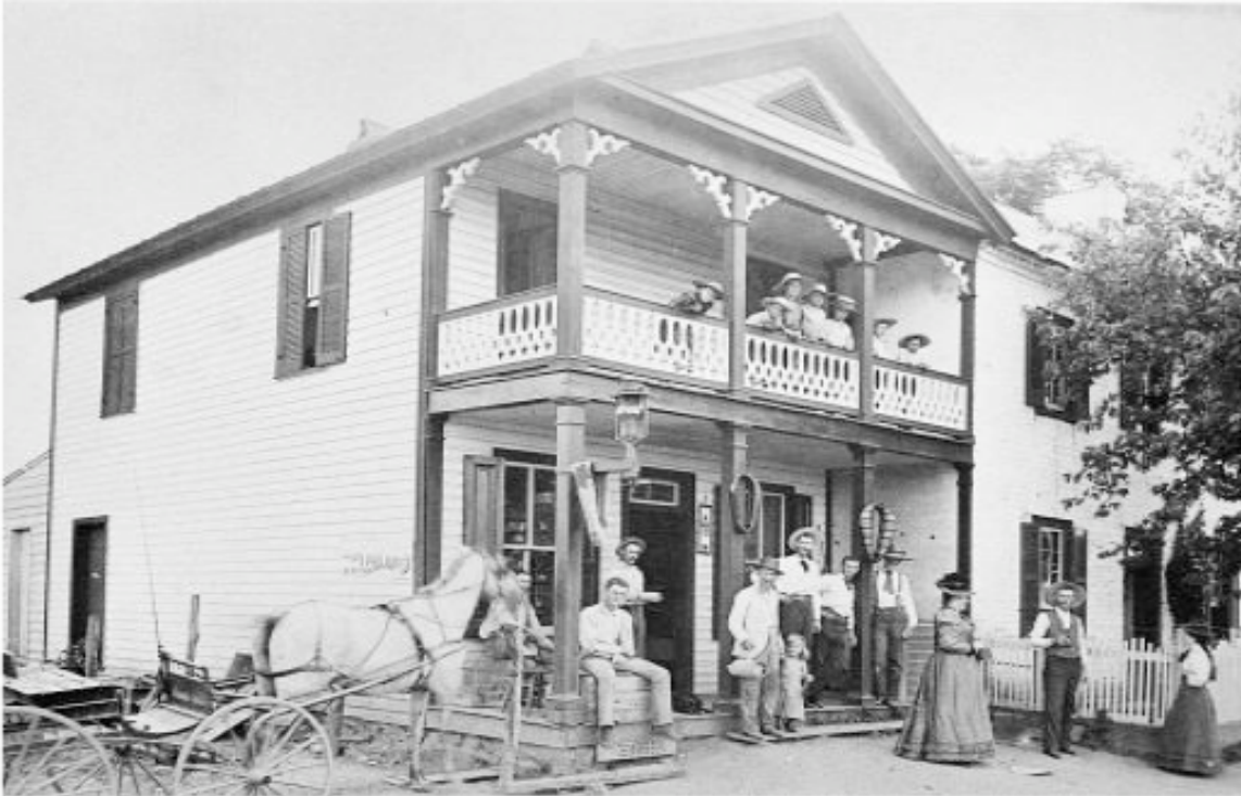
Unison Store and Post Office (1895)

Directions to the run: Get directions from Google Maps