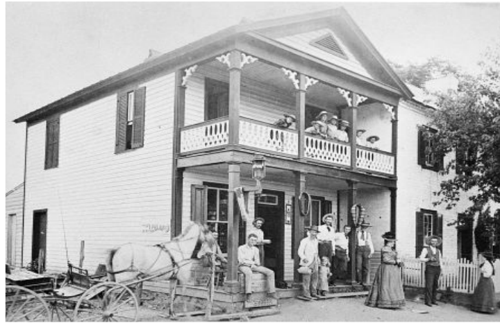
Unison Store and Post Office (1895)